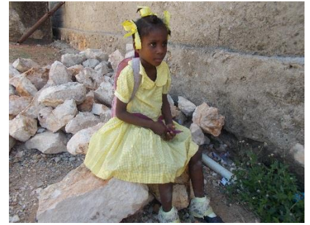
So hard to say goodbye to some.

We stayed at the orphanage and adjacent school in a small but sufficient 2 nd story guest room. We had electricity in the evening when the generator was on for lights and fans, Water was supplied by poly tank on the roof. We were close to all the action and often visited by children.