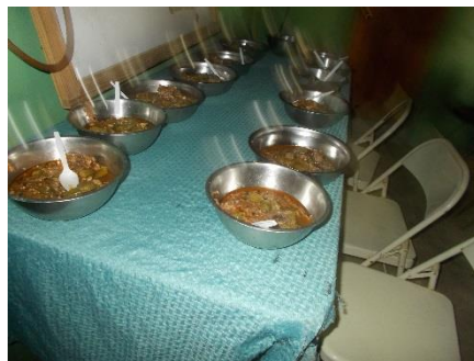
Two cooks prepare meals for 39 orphans and three staff.